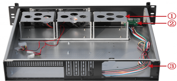
①. 硬盘架 ②. 开关板组件 ③. 电源位